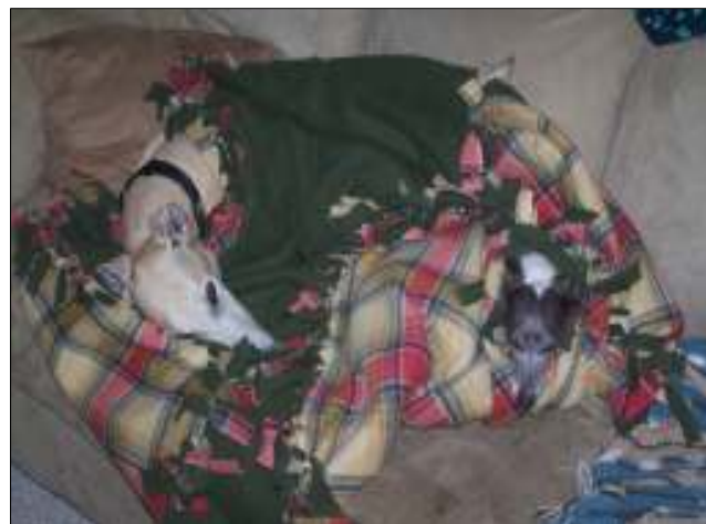
Apollo and Vinnie curled up under a blanket together. Spoiled by Naomi Knecht & Matt Weaver

or displays evidence of returning to ictus after the removal of the ice, the ice should once again be applied until the patient regains sternal recumbency (when chain seizures occur, aggressive medical intervention is necessary) Clients have used bags or boxes of frozen vegetables, but such applications are reported to be less effective.